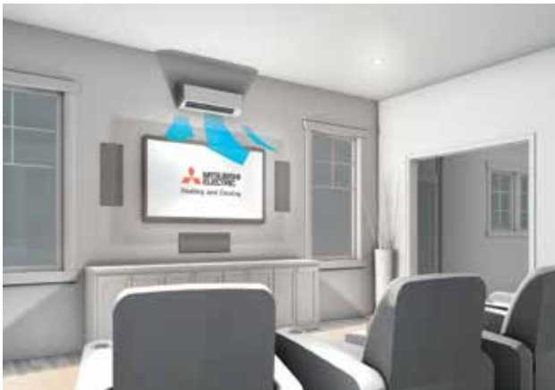
Living Rooms / Media Rooms